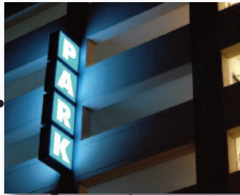
Parking Lots & Garages