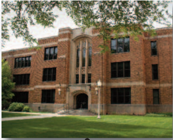
Schools & Universities